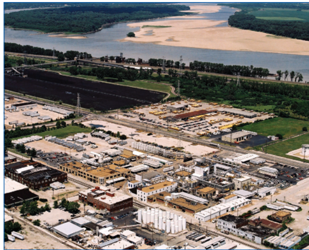
ELANTAS PDG, Inc. headquarters in St. Louis, Missouri

ELANTAS Electrical Insulation companies are strategically located throughout the world to meet the primary insulation, secondary insulation and electronic and engineering materials needs of our customers.